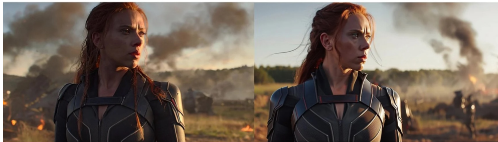
Black Widow MARVEL