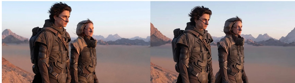
Dune